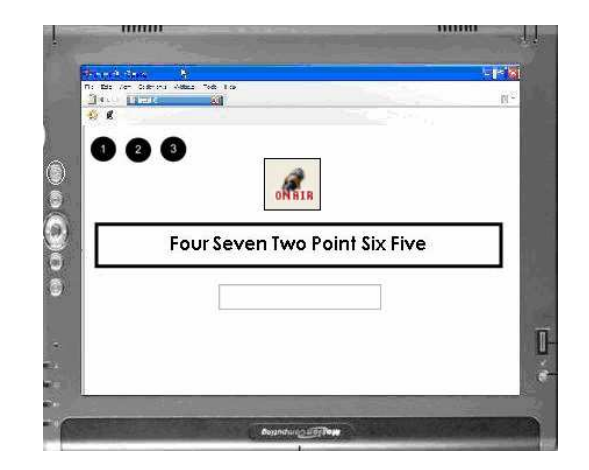
Fig. 5. Microphone Testing Application