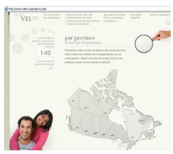
Figure 3: Interface of research by provinces of veltic.ca

December 1 2004, from http://www.acelf.ca/liens/crde/articles/10-landry.html