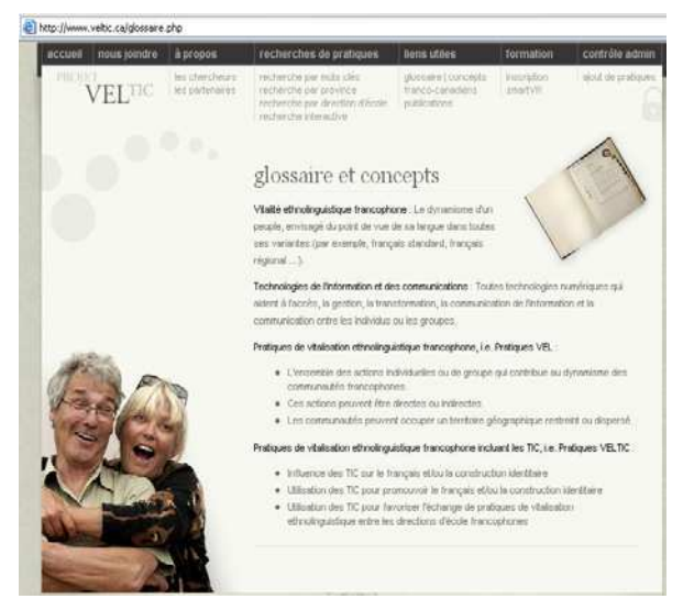
Figure 2: Interface of veltic.ca