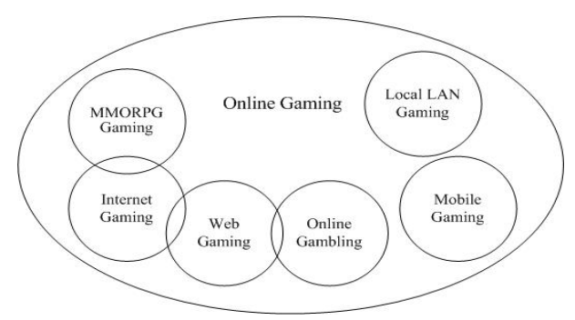
Fig. 1. The different kinds of online games

Online gaming or online games are the games that are online via the LAN, Internet, or Telecommunication. They are distinct from video and computer games that are not networked. Normally, all technical requirement for playing online games is a web browser and/or appropriate client software. A game played in a browser is called a browser-based game or web game. In broad definition, online gaming includes Internet gaming, web gaming, online gambling, local LAN gaming, and mobile gaming, but not the non-networked video and personal computer gaming. Figure 1 illustrates the different types of online games. Within the diagram, the overlapping circles such as MMORPG, Internet, Web and online gambling games are generally operated through wide/public network environment. Mobile gaming is operated by telecommunication, and local LAN gaming is operated by local/private network.