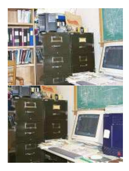
Figure 1: Two images which have 127 matching features selected by hand.

In Figure 1 are two images, each of size 768 \times 512 that we use in the experiments. Each image has a white box at the predefined features. The correspondence between the features (that is which of the crosses match) is selected by hand, and is the ground truth. We have used three pairs of images to perform the experiments.