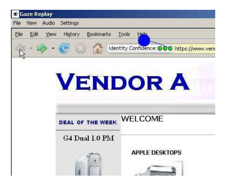
Fig. 3. A screenshot of the eye tracker replay function. The large circle near the identity confidence indicator shows the participant's fixation on that region of the screen.

One of the more interesting findings in the eye tracking data was how long users spent gazing at the content of the web pages as opposed to gazing at the browser chrome. On average, the 15 participants who gazed at traditional indicators, new identity indicators, or both, spent about 8.75% of time gazing at any part of the browser chrome. The remaining 13 participants who did not gaze at indicators spent only 3.5% of their time focusing on browser chrome as opposed to content. These percentages may have been even lower had the tasks involved in the study taken longer to complete. While other studies have found that many users are unable to distinguish between web page content and chrome, ours suggests they do distinguish between the two and that they rarely glance at the chrome at all. This finding was also supported by the participants' comments during the follow-up interview. When the identity indicators were pointed out to participants, many made comments such as "I didn't even think to look up there" or "I was only focusing on the web page itself."