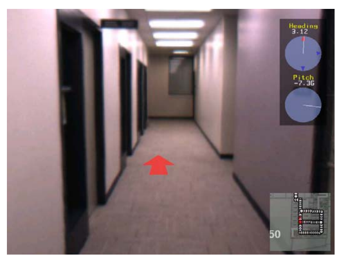
Figure 3: Display interface of the cubic panorama viewer.

The 360-degree view orientation is controlled in real-time using standard input (ie: mouse and keyboard) or an Intersense inertial tracker<sup>3</sup> mounted on a Sony i-glasses<sup>4</sup> HMD. Figure 3 shows the viewer display interface.