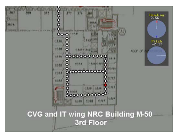
Figure 4: 2D connected graph of panorama locations.

When a user moves to a new location, the new panorama is loaded from disk and displayed in the viewer. Recall that the actual cube and viewpoint location remain fixed in the 3D world. Moving to a new location is simulated by changing the face textures of the cube quadrilaterals from the previous panorama images to the new one. A global orientation is maintained during navigation by specifying an offset for each panorama cube. When a cube is loaded, the local orientation is determined by combining the global orientation and the cube offset. The local orientation is updated automatically when the new cube is loaded, so the user gains a sense of physically moving in the direction they were facing, even though their position does not change in the 3D world. Many panoramas are captured in sequences to prevent large jumps when navigating. Manipulating the local orientation within a panorama simulates moving your head in the real world. Moving to a new panorama in the system simulates walking in the real world. Cubes also contain GPS data for outdoor environments, which can be used for automatic localization on maps. The environment is stored in XML format, so that the individual panorama cubes can be easily extended to include additional data.