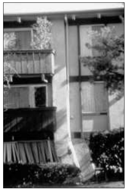
Figure 2. Excessive deformation of a weak first storey in an apartment building, Northridge earthquake 1994. In another part of the building the ground floor collapsed completely.

wall" or "pony wall." The knee wall is the short stub wall in some buildings between the top of the concrete or masonry foundation and the ground floor joists. Its collapse threatens the integrity of the entire structure. The deficiency is often a lack of bracing rather than large openings in the knee wall.