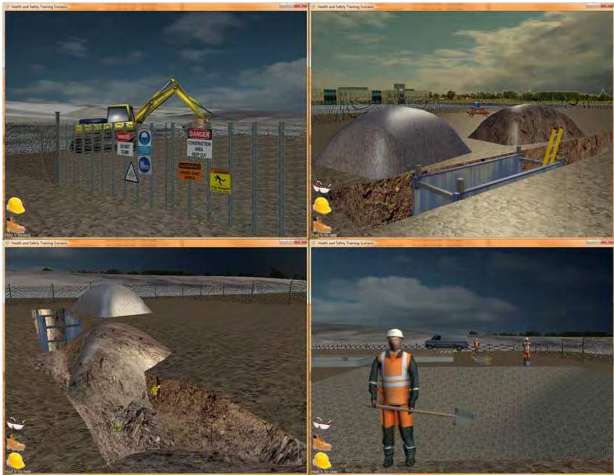
Fig. 1: Scenes from the Trenching Safety Game

minimise cost while meeting safety requirements for varying soil conditions, trench depths and space availability on the site.