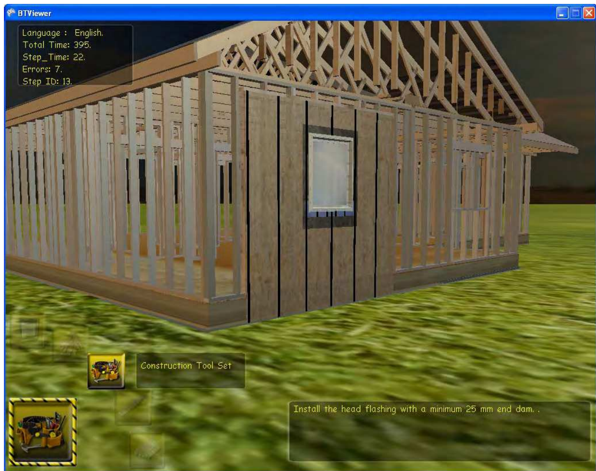
Fig. 2: Screenshot from the window installation guide.

It remains that subjective factors will decide the adoption and the full participation of the student, and the approach is to encourage student engagement by creating the scenario so it will do what a human teacher/mentor would do, and to do it in a way that matches each individual learner. One popular mechanism to do this is by introducing avatars into the game. An avatar represents one party, a pedagogical agent, in an interactive exchange with the objective of increasing the motivation of the players. Avatars come in three common forms as described below: