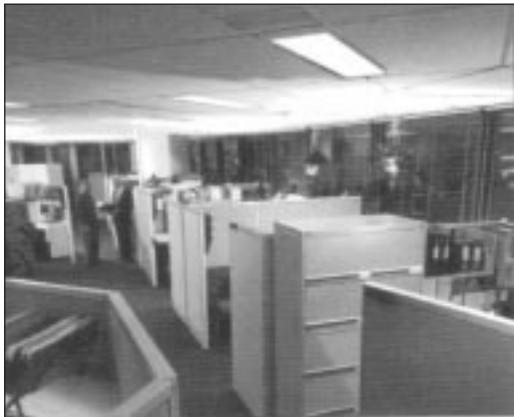
Figure 2. Achieving acceptable IAQ depends not only on the quantity of ventilation air but also on adequate distribution to individual workstations.

Conditions for Human Occupancy. For office buildings in North America, these requirements can usually be met by supplying 10 L/s of ventilation air per person into a building through outdoor-air intakes that are located away from any known outdoor contamination sources, such as a parking lot. The distribu-