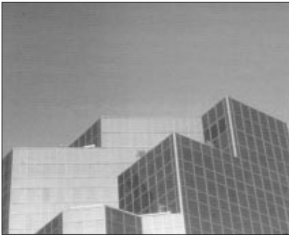
Figure 1. Typical high-rise office building in which the ventilation system plays a key role

The most frequently identified causes of poor indoor air quality that are directly related to building designs and operation, are air contaminants and inadequate ventilation. For