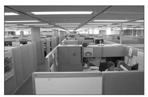
Figure 1. Millions of North Americans work in regular grids of cubicles like these.

Well-designed workstations in an open-plan office will assure a comfortable, satisfying working environment for occupants. This Update reviews some of the key design issues and provides guidance for achieving a successful outcome, based on research conducted at NRC's Institute for Research in Construction and elsewhere.