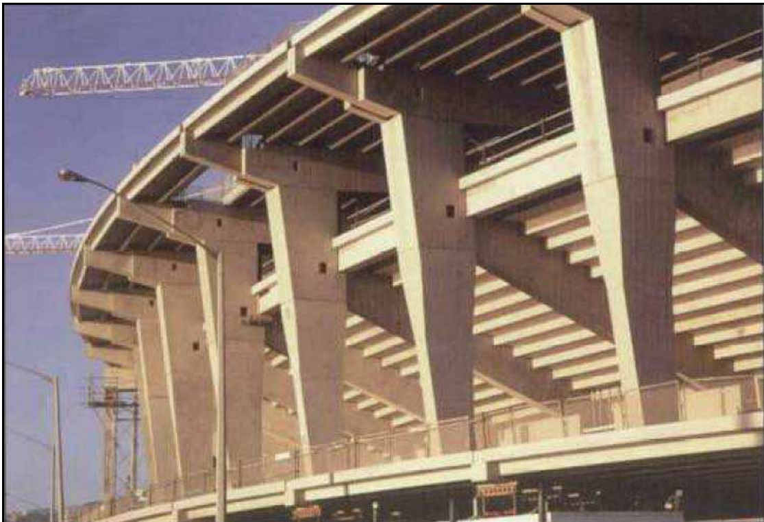
Fig. 3: Wellington Stadium during construction, New Zealand [18]

HPC bridges in Ohio, USA [19] – The Ohio Department of Transportation has used high-performance concrete to build bridge decks for more than 12 years. Their typical HPC mix design has a water-cement ratio of 0.42, including ASTM Type 1 cement ( 255 \text{ kg/m}^3 ), slag ( 100 \text{ kg/m}^3 ), fine NWA ( 755 \text{ kg/m}^3 ), coarse NWA ( 1045 \text{ kg/m}^3 ), and 7% entrained air. A detailed survey of HPC bridge decks in Ohio revealed that the decks constructed with coarse NWA with an absorption capacity near 1.5% had a significantly lower propensity for cracking than similar bridge decks built with NWA of an absorption capacity near 0.5%. The survey indicated that, in both cases, the construction and external curing practices used in the surveyed bridge decks were comparable. It was concluded that this difference in absorption capacities of the NWA was key to the reduced cracking. A simple calculation can demonstrate that a 1% difference in absorption for 1045 \text{ kg/m}^3 of coarse aggregate can provide a 10 \text{ kg/m}^3 difference in internal curing water, which is not negligible.