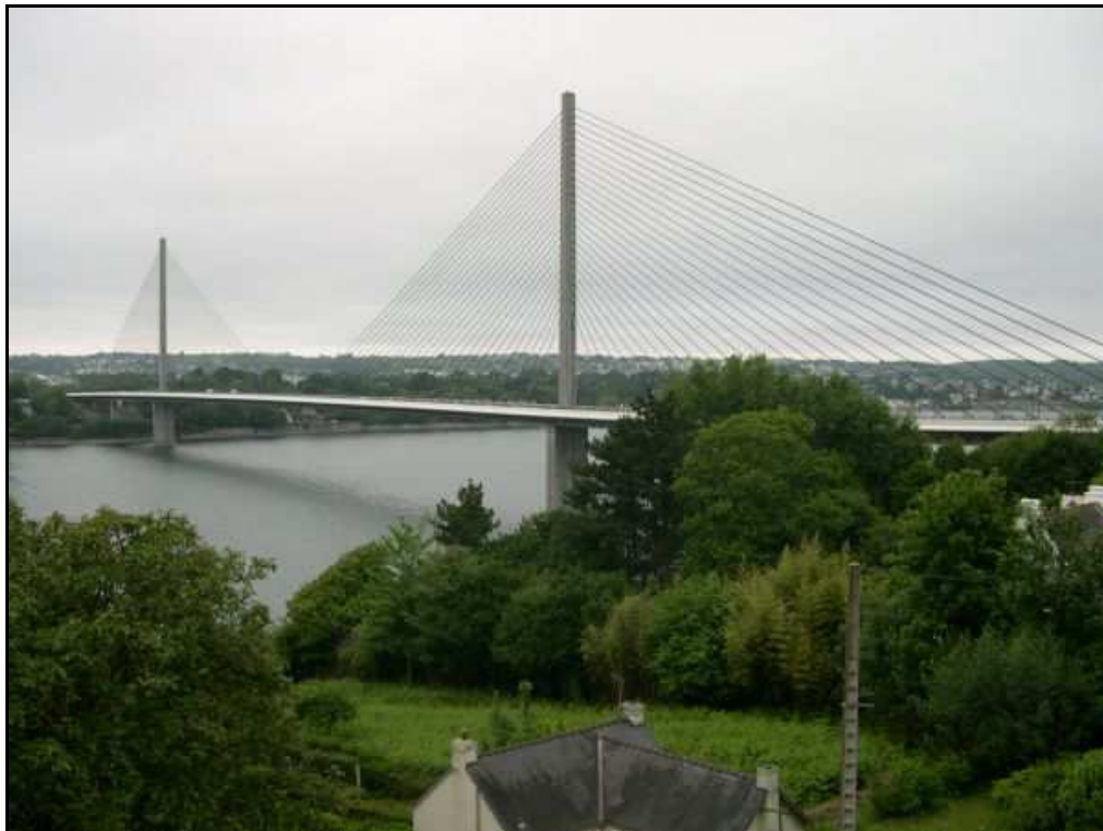
Fig. 2: Iroise Bridge, City of Brest, France

The Iroise Cable-Stayed Bridge, France [17] – Built between 1991 and 1994, this 800-m long lightweight concrete bridge crosses the Elorn River in the city of Brest in Bretagne. With four lanes of traffic, the bridge is composed of a 400-m long central span and two 200-m long access spans, supported by two 120-m long high-strength concrete pylons. Lightweight concrete, with a density of 1800 kg/m 3 , was used in the bridge deck with the goal to reduce its mass by 2200 metric tons. The coarse aggregate was an expanded shale with a bulk density of 700 kg/m 3 and a water absorption capacity of approximately 4% at 48 hours. The fine aggregate was a normal-density 0-2 mm siliceous sand. The lightweight concrete had a water-cement ratio of 0.43, a cement content of 400 kg/m 3 , an average 28-day compressive strength of 45 MPa and an elastic modulus of 23 GPa. Internal curing with pre-soaked coarse lightweight aggregate (providing up to 18 kg/m 3 of IC water) and external curing were provided to the deck concrete. It was observed that this lightweight concrete mixture provided adequate workability and that all design requirements were met or exceeded.